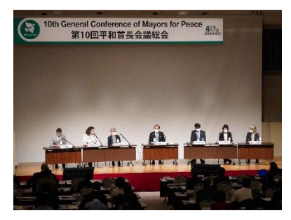
10th General Conference (October 2022, Hiroshima)

Mayors for Peace holds an Executive Conference generally once every two years in one of the executive cities, where executives discuss future initiatives and plans for the next General Conference.