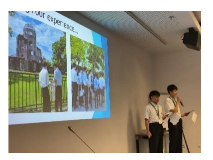
Presentation by Mayors for Peace youths at the Mayors for Peace Youth Forum held in UNOG (August 2023, Vienna)