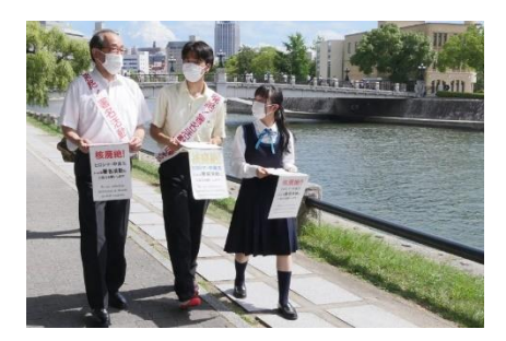
Petition Drive by the President and high school students in the street (August 2022, Hiroshima)