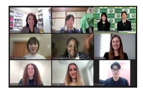
Holding a Peace Education Webinar (February 2024, Hiroshima)